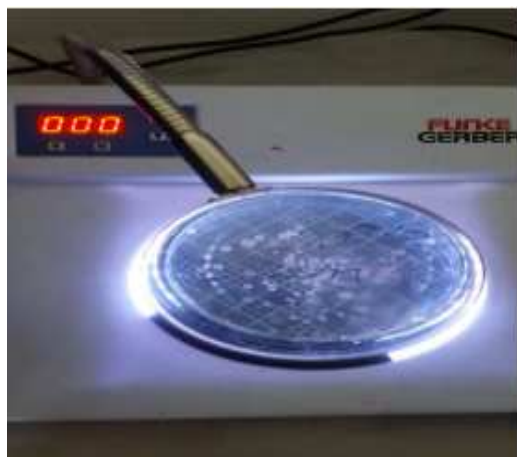
Figure 5. Counting colony forming unit.

Like the following lab MOs cont. technics.