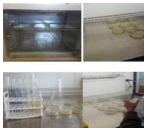
Figure 2. Serial dilution and incubation lab work.