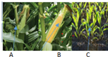
Figure 8. Effectivity of crops (maize) growth (control, LBF and CF).

Effectivity of plant growth The basic factor that affecting the plant growth were; light, moisture (water), temperature and nutrient in this experiment we take constant suitable condition of light and moisture. The response can be obvious for plant growth of plant height (in meter) and maturity period. within crops (maize) growing on the vent.