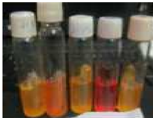
Figure 7. Carbohydrate fermentation test.

change of media from red to yellow Negative result show – No change of media color.