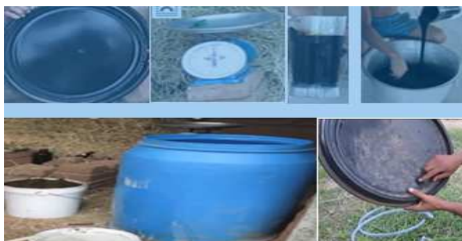
Figure 1. Schematics of the bio-fertilizer production material and preparation technics.

of milk/whey and 10liter of non-chlorinated water followed by gentle mixing secondly we do another experiment with the Procedure prepare 1000ml of plastic pot within the pot we put the following ingredients; 100 liter of non-chlorinated water, 20 liter of fresh rumen, 40-50 liter of fresh cow manure, 3kg silica and phosphorus, 2kg of rock dust (basalt) and 1/2kg of fermi pan finally putting prepared microbe's nutrient from first step. mix together the plastic pot. Then finally make the following condition Creating airlock and Secure with wire up to air can escape but not return to barrel. For 15-days then the product ready to use as bio-fertilizer.