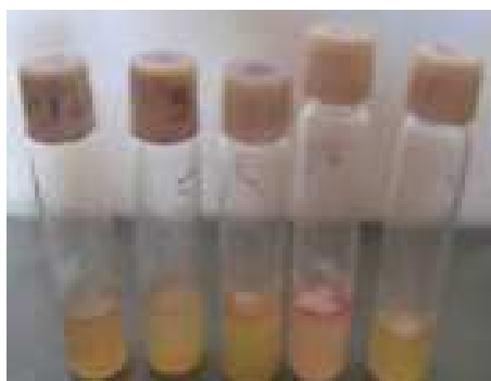
Figure 6. Indole test.

Indole test like figure show bellow that Starch in the presence of iodine produces a dark-blue coloration of the medium, and a yellow zone around a colony in an otherwise blue medium indicates amylolysis activity.